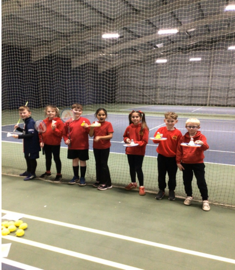
Celebrating our participation in the Badminton Festival!